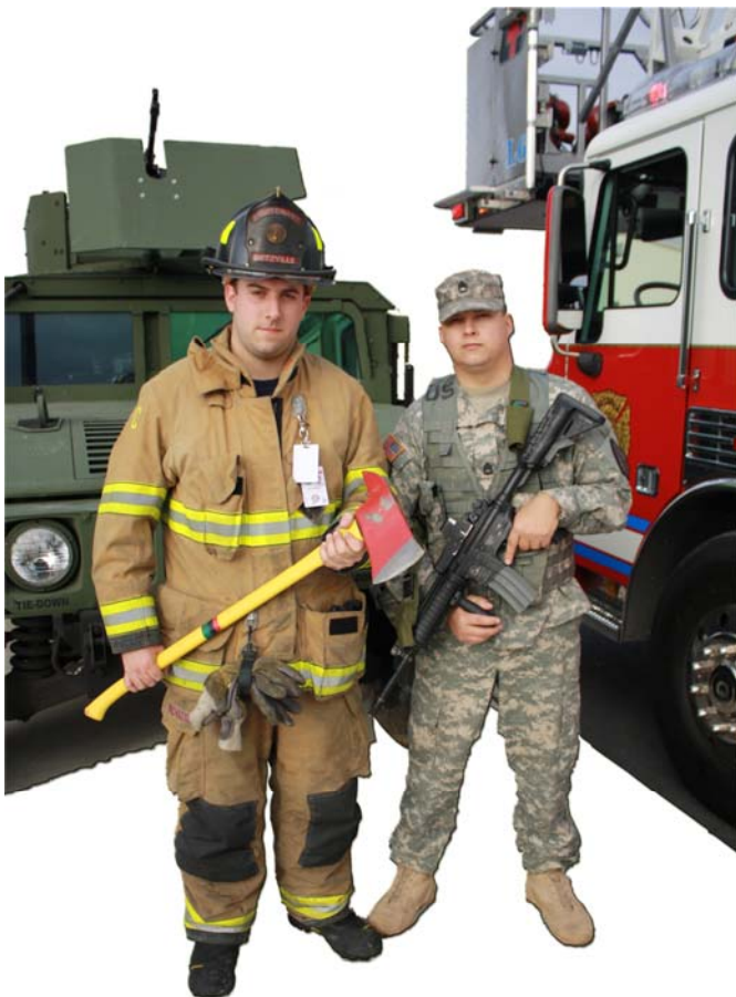
The values we share between these two great American institutions are a mirror image of each other, as are the attitudes and attributes of the people we're hoping to enlist.

On the other hand, we could make it a very positive experience where we turn it into a celebration of one's already demonstrated dedication to serving the fire service. We could make a ceremony out of it and, like I always strongly encourage, take advantage of the opportunity to acknowledge and bring recognition to the people making the real sacrifices – our spouses and our families.