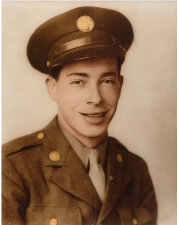
My father enlisted in a National Guard unit and served in the Pacific in WWII. When the Korean War broke out, he re-enlisted – despite starting a family at home. He earned two Purple Hearts and a Bronze Star.

Sure, there are people who transfer from volunteer fire department to department and some folks who leave our ranks for whatever reason, only to return at a later time in their life. I guess you could call that re-enlisting.